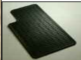
Heel Pad IN012