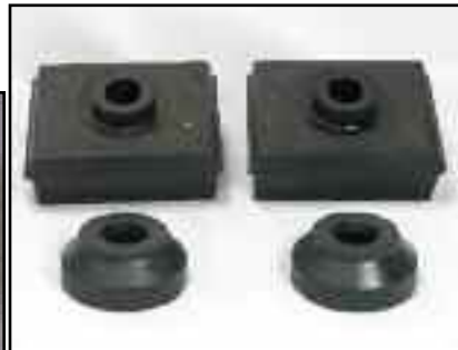
Motor Mounts New Tooling as Original BR000