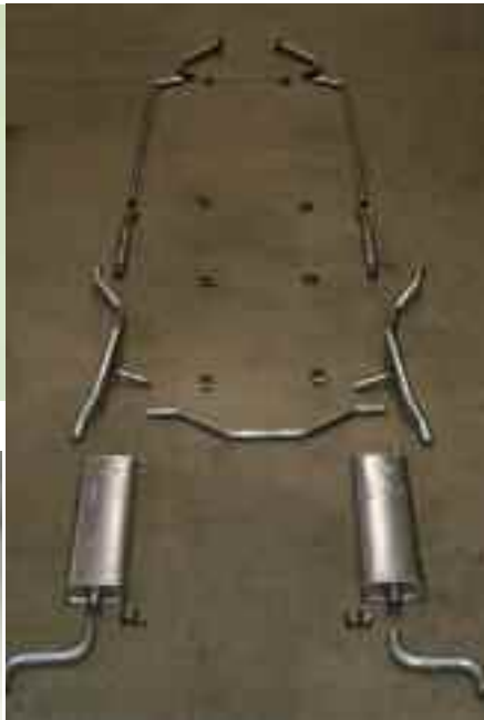
Exhaust System EX069