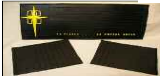
Battery Rubber Overlays Copies from Orig. Battery EL009A