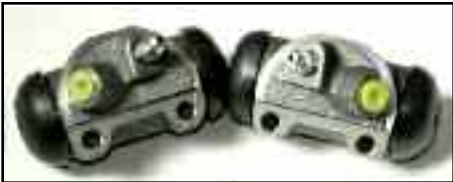
NEW Front Wheel Cylinders & Hoses BR000A1 $135