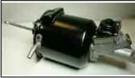
Brake Booster & Master Cylinder BR001