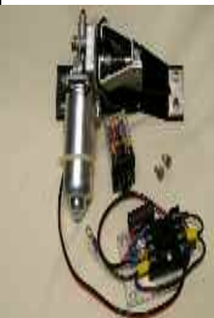
Vent Motor Conversion