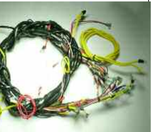
Complete Wire Harness EL039/040