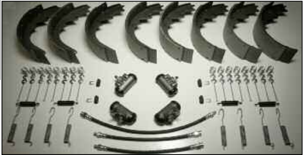
Brake Rebuilding Kit 4-New Cylinders, Hoses, 8-Riveted Shoes, & Springs Kits BR000 $349