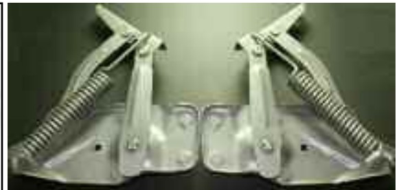
Hood Hnges HO015 (Above) Trunk Hinges TK011 (Below)