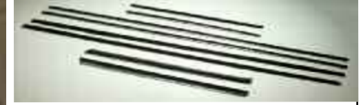
Window Wipes DO030