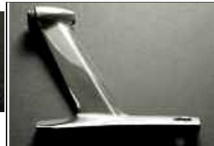
Mirror Arm BO016B