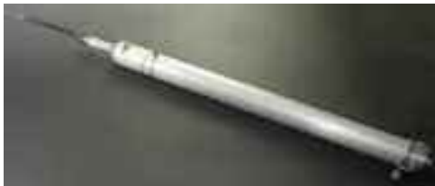
Rebuilt Antennas BO010