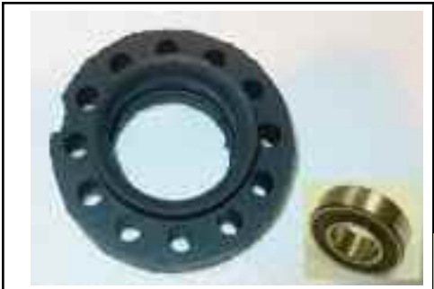
Driveshaft Insulator & Bearing Mark II BR016 / BR017 Our Improved Exclusive Item