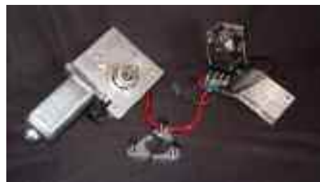
Quarter Motor Conversion