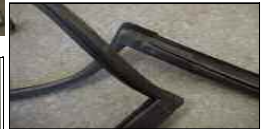
All Rubber Weather-Stripping Large Inventory