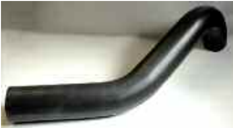
Fuel Filler Hose FS0199