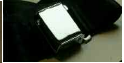
Lap Belts Many Colors