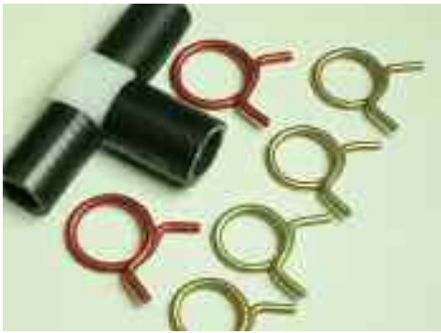
Fuel Vent Tee FS020A