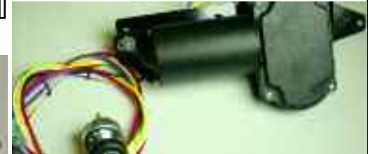
Electric Wiper Conversion BO015W12