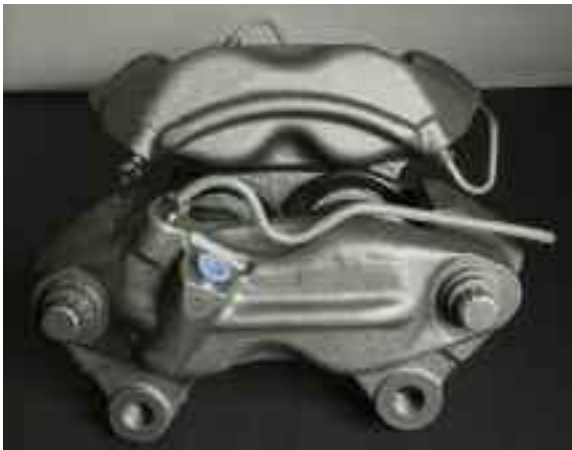
Rebuilt Calipers XXBR00969R/L