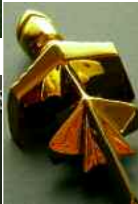
1956 Hood Ornament Gold Night Bust XXHO0016