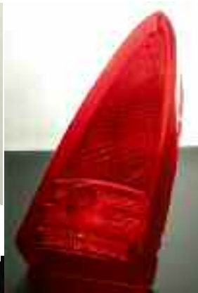
1957 Tail Lamp XXLAT00457R