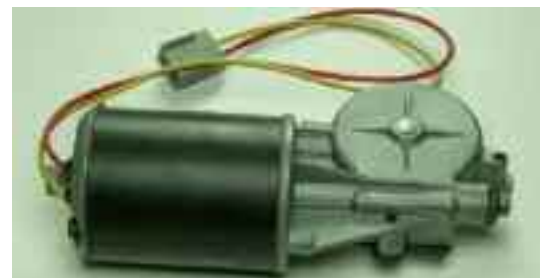
1966-89 Window Motor's XXEL00206--