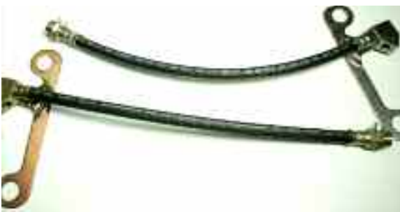
1965-69 Front Brake Hose XXBR004--