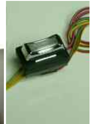
1969-72 Window Switch XXIN029H