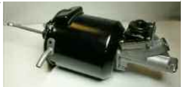
Brake Booster/Master Cylinder (1954-60 All Models) XXBR001--

NEW EXHAUST MANIFOLDS 430/462/383" 429/460" Engines Re-inforced to Last Forever