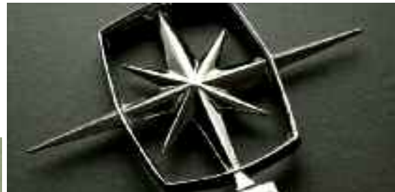
1958-60 "Premiere" Hood Ornament XXHO0016B