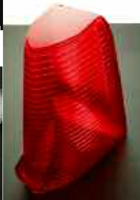
1961-64 Tail Lamp XXLAT00461