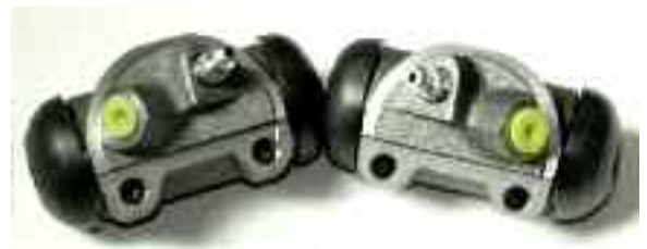
1949-64 Front Wheel Cylinder's XXBR009----