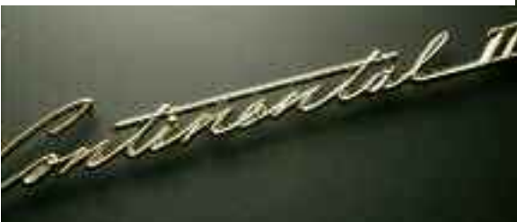
1958 Mark III Fender Nameplate (Gold) XXBO003677