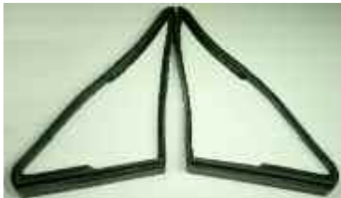
1949-65 Door Vent Seal's XXDO034--