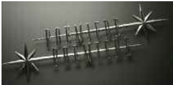
1956 (Gold) Quarter Nameplate 1957 (Chrome) Fender Nameplate