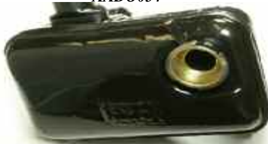
1961-69 Surge Tank's XXCH002A