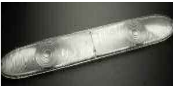
1956 Park Light XXLAP0037RL