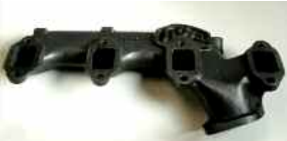
New 430/462/383" Exhaust Manifolds XXEX01466L/R-RP