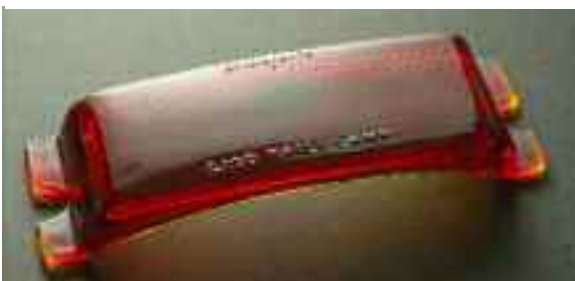
1942-48 Tail Lamp XXLAT003942