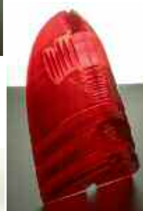
1955 Tail Lamp XXLAT003955