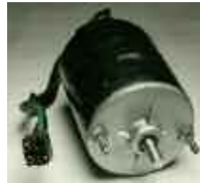
1956-65 Window Motor's (New & Rebuilt) XXELO26--