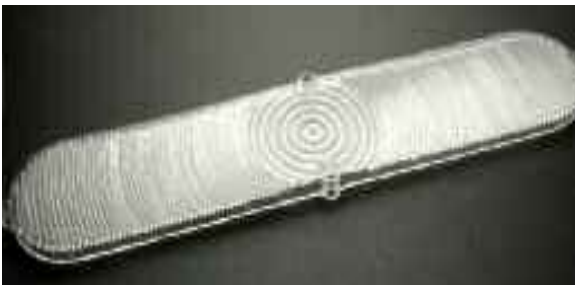
1957 Backup Lens XXLABU0557