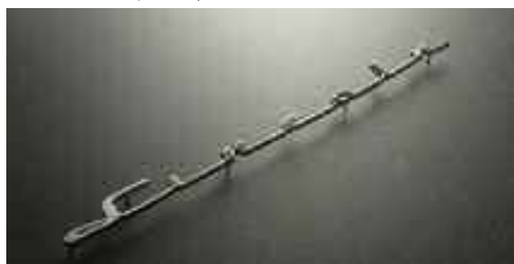
1954-55 Fender Nameplate (Chrome) XXBO00035