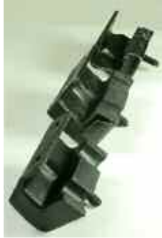
1949-79 Motor Mount's XXEN003-