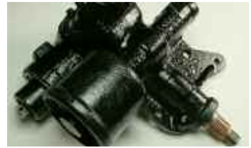
Steering GearBox's XXST001--