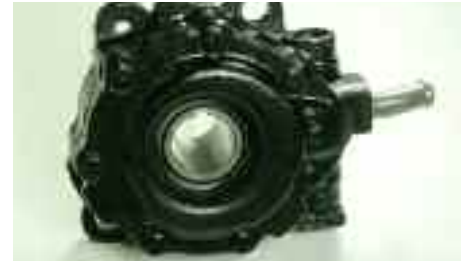
60-69 Power Steering Pump's XXST002--