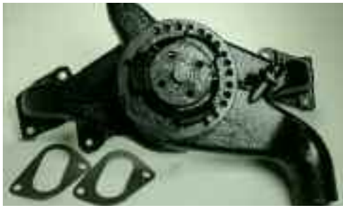
1949-79 Water Pump's XXCH014A/H