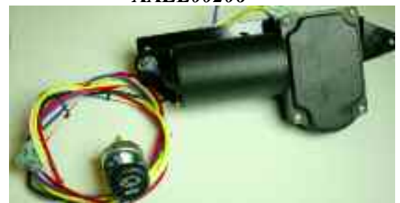
56-60 Electric Wiper Motor Conversion XXBO015W12