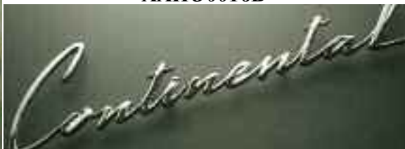
1960 Fender Nameplate (Chrome) XXBO00367B