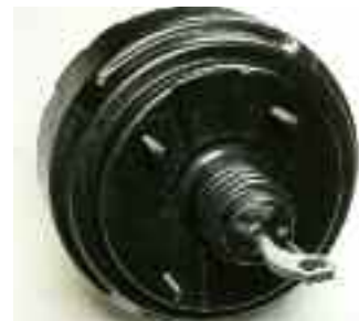
1961-69 Brake Boosters XXBR001B1-7