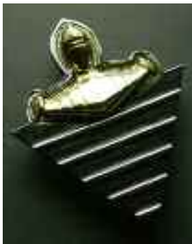
1954 Quarter Emblem (Gold/Silver/Black) XXBO00384