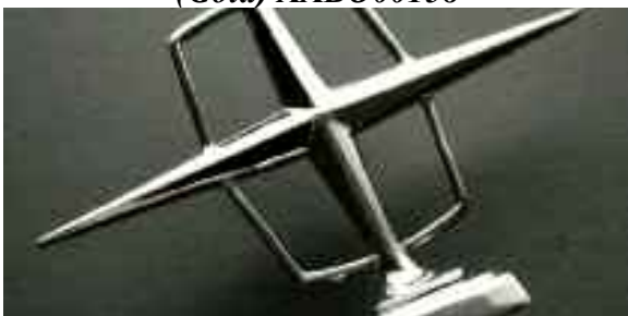
56-64 Hood Ornament XXHO0016A 65-66 Hood Ornament XXHO0016D 67 Hood Ornament (2 pc) XXHO0016E