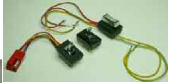
NEW Window Switches for 1956-79 Lincolns