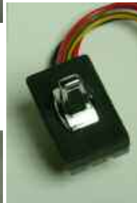
'67 Window Switch 1952-54 Tail Lamp XXIN029G XXLAT003952