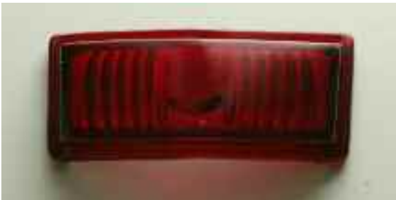
1942-48 Zephyr Stop Lamp Lens XXLAT003942A