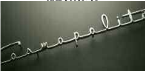
1950-51 Fender Nameplate (Chrome) XXBO0030A1