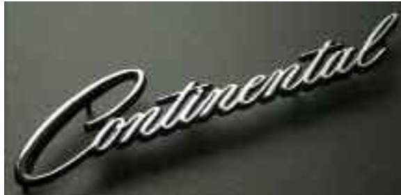
1964-73 Quarter Nameplate (Chrome) XXBO0081V4