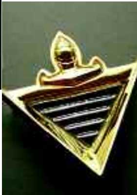
1953 & 55-56 Quarter Emblem (Gold/Silver/Black) XXBO00383