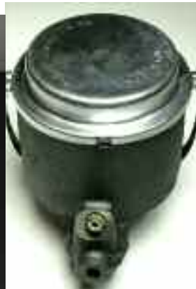
Master Cylinders XXBR001M2-9