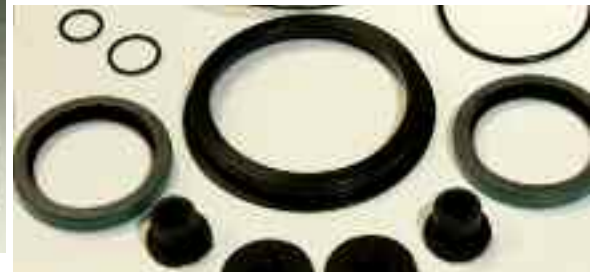
60-69 Steering Pump Kit XXST002K1