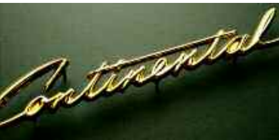
1958 Grille Script (Gold) XXBO00158