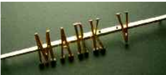
1960 Quarter Nameplate (Gold) XXBO0081V31