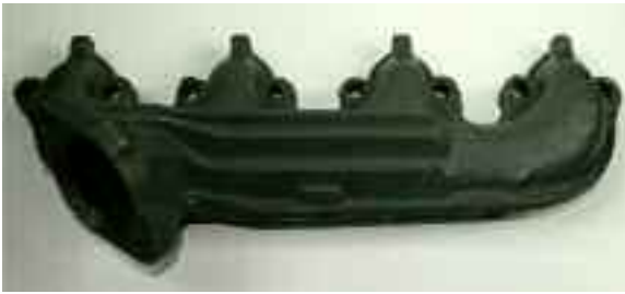
New 460"/429" Exhaust Manifolds XXEX01469R-RP (Right Side)