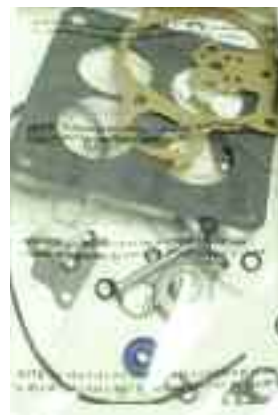
1937-74 Holley/Carter Carb. Kit's