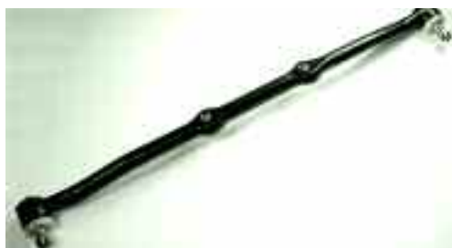
1952-69 Center Drag Link XXSU024A