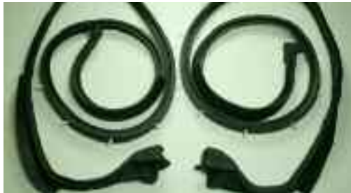
1949-79 Door Weather Seals XXDO032--