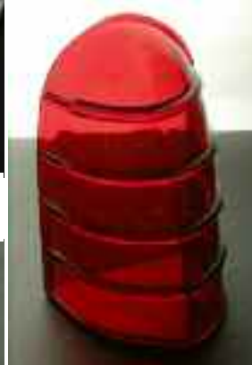
1951 Tail Lamp XXLAT003951