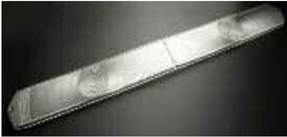
1957 Park Light XXLAP0038